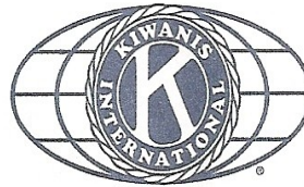
Kiwanis Club of Barnesville